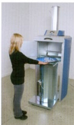
The optional BOB (Bag Or Bale) trolley for easy compacting of light waste material into bags or bales.