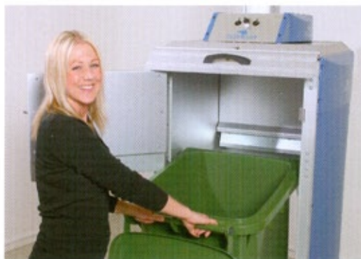
Choose FL80 for 240 l bins and FL100 for up to 370 l bins.

Based on an ingenious modular system and made from maintenance-free aluminium. Easy to feed waste material through large front loading door.